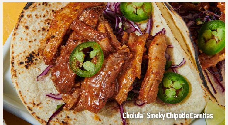
Cholula Smoky Chipotle Carnitas

Offer valid on purchases from January 1, 2023–December 31, 2023. Restrictions apply; please see rebate details, terms, and conditions on back.