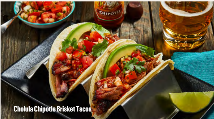
Cholula Chipotle Brisket Tacos