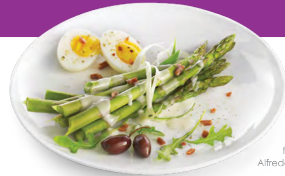
Warm Arugula and Asparagus Salad featuring STOUFFER'S® Alfredo Parmigiana Sauce

YES! I would like to receive future information from Nestlé Professional via email and/or postal mail.