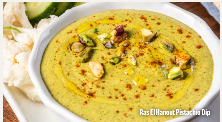
Ras El Hanout Pistachio Dip

Maximum varies by brand. Offer valid on purchases from January 1, 2022–December 31, 2022. Restrictions apply; please see rebate details, terms, and conditions on back.